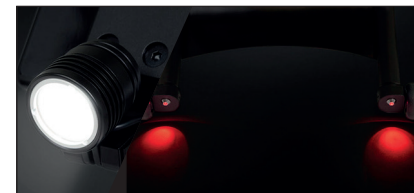
700-lumen front light with position lights / high beam options. Dual LED tail light on the stand frame.