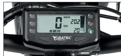
All-in-one LCD screen with gear selector.