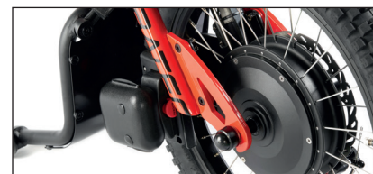
Removable right dropout for easy inner tube or tyre change.