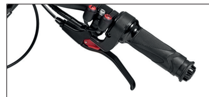
Avid BB5 mechanical brakes, aluminium levers and parking brake.