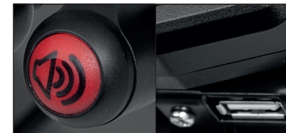
Horn and USB port.