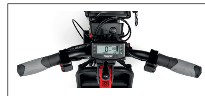
G&B handlebar option without levers for quadriplegics.