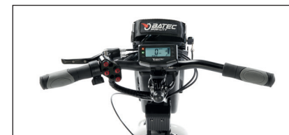
Handlebar option with right or left Monolever brakes for hemiplegics.