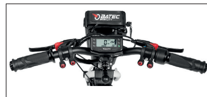
Matte black aluminium handlebar with folding system for convenience.