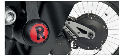
250 RPM 900W high torque brushless motor with reverse gear. Maximum speed 25 Km/h.