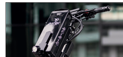
Autonomy of 22 km * with a 36v - 280 Wh battery. Autonomy of 40 km * with a 36v - 522 Wh battery. 4A Charger.