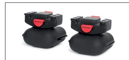
Removable QR weights.