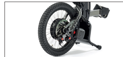
18" Wheel, ultra-grip tyre and aluminium double-wall rim.